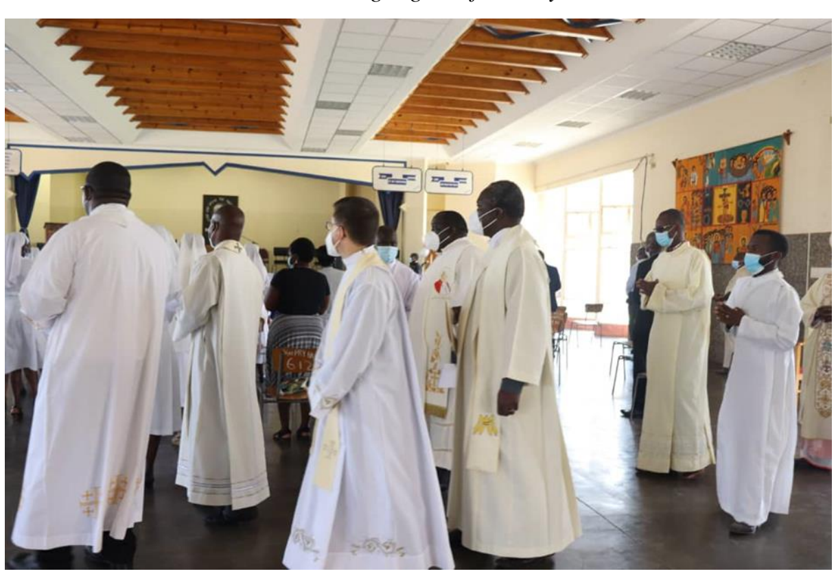
Below, highlights of the day

The Congregatio Jesu Sisters in Zimbabwe Region is part of a global Institute found in twenty-four countries across the four continents and have the Ignatian Spiritual traditions. We partake in the mission of the church by being apostolic religious women. In Zimbabwe we serve the people of God in nine communities throughout the country.