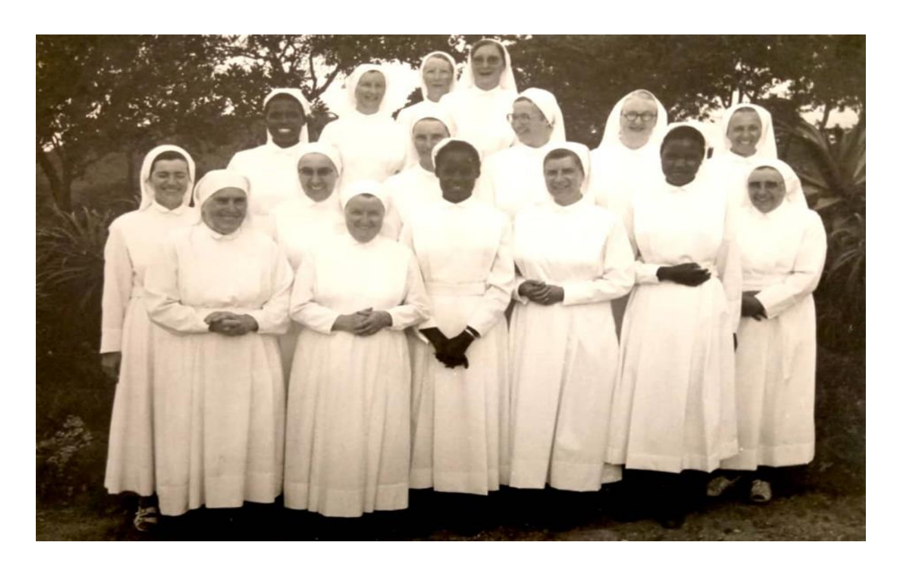
Early foundations of the CJ Sisters with the first African Sisters in the year 1975